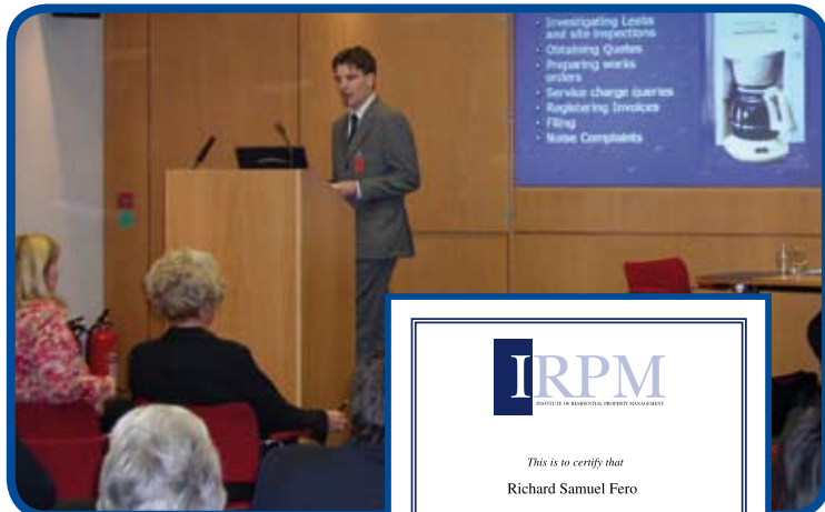
An IRPM seminar - an opportunity to have your say.

Formed in 1991, ARMA is the only trade body in England and Wales to focus exclusively on matters relating to the block or estate management of residential long leasehold property. With over 185 corporate members managing in excess of 750,000 units in an estimated 30,000 blocks of flats or estates, the Association's founding principal aims are to represent the interests of and to improve service standards for lessees and landlords alike.