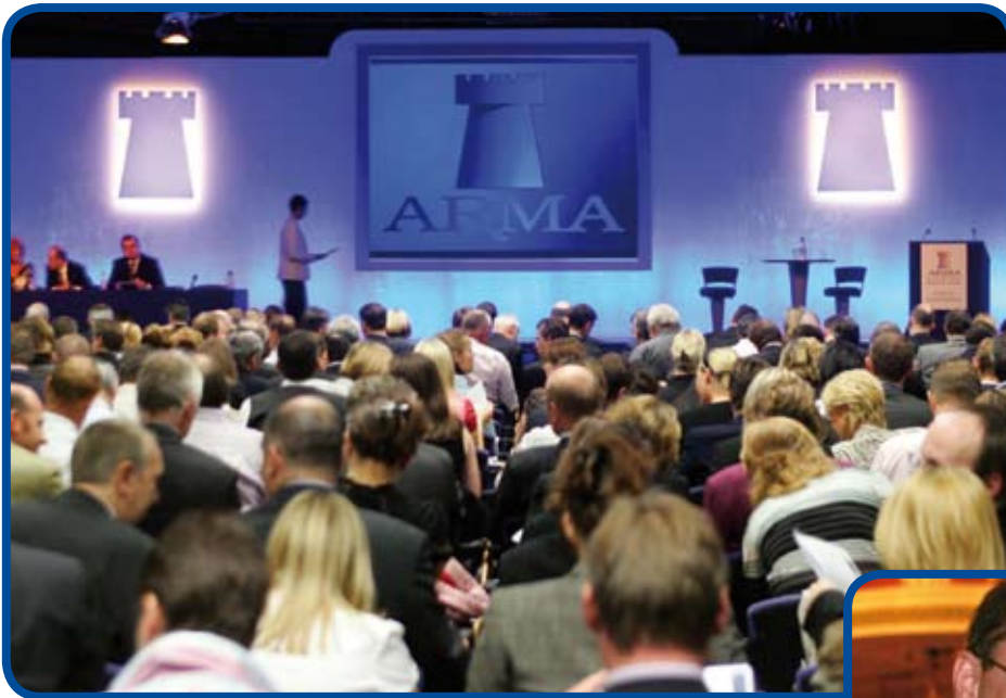
ARMA's annual national conference attended by over 500 delegates.