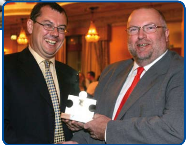
Having fun winning the ARMA Annual Award.